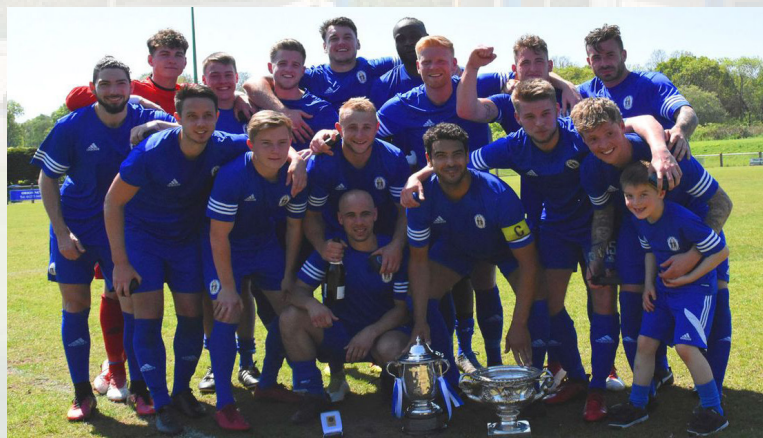
The side which won the SCFL in 2018