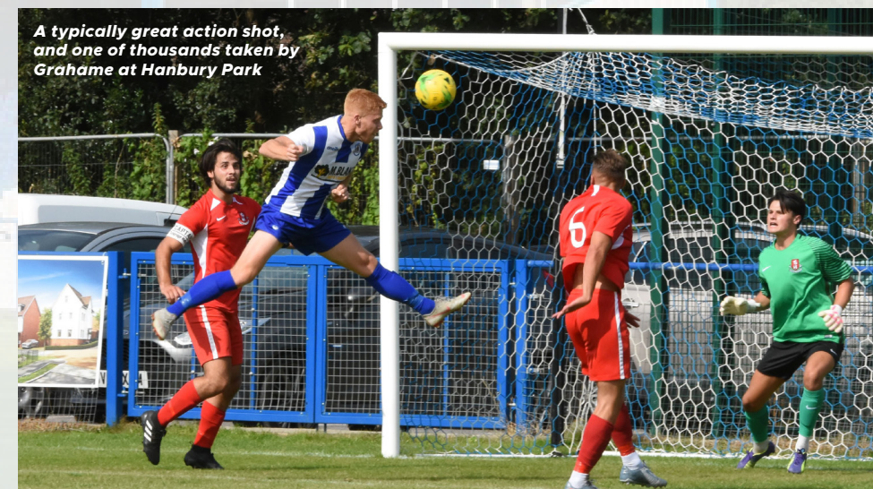
A typically great action shot, and one of thousands taken by Grahame at Hanbury Park

These are just a sample of the many tributes that were posted in the days following his passing. Sadly, space does not allow for them all to be reprinted in this tribute.