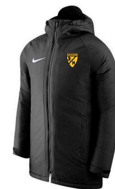
Winter Jacket From £55.97 Youths & £73.46 Adults

VISIT clubwebshop.com/kenningtonfc FOR THE FULL RANGE