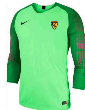
L/S Replica GK Shirt From £32.17 Youths & £41.96 Adults