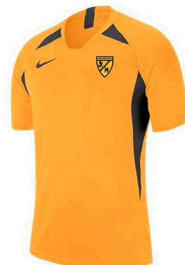
Replica Home Shirt From £10.47 Youths & £13.97 Adults

Get 30% off RRP on all non-accessory items, and help the club in the process with each purchase made!