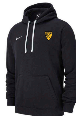
Club Hoodie From £18.17 Youths & £27.96 Adults