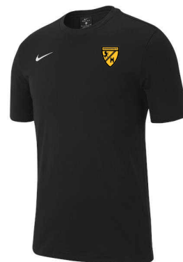
Training T-Shirt From £8.37 Youths & £12.56 Adults