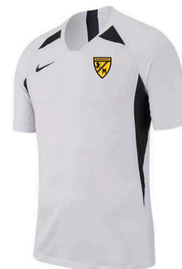
Replica Away Shirt From £10.47 Youths & £13.97 Adults